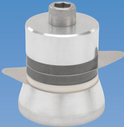
Patented Ceramically Enhanced Transducers

Crest's Powersonic™ rugged industrial strength performance gives you consistent quality at a benchtop price.