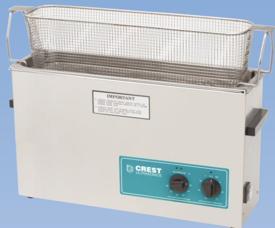
CP 1200 HT with SSMB 1200-DH Mesh Basket with Drain Positioning Handles

* Digital controls not available with CP 200 model